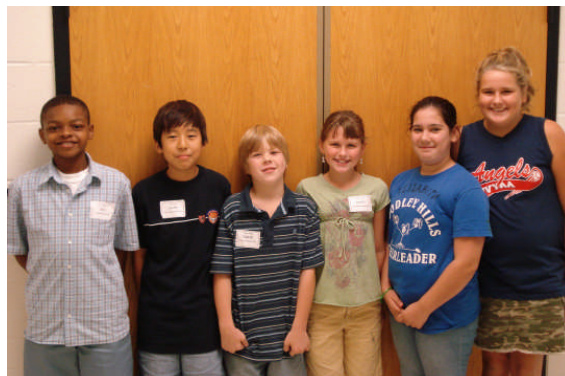
Region 9 elementary officers pose for pictures.

* Registration Forms are only available on our Web site. Visit www.vassp.org/dsl.html to download your information packets. For more information, contact DSL/VSCA by calling 804-355-4263.