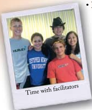
Time with facilitators

Participants will live two to a room in residence halls rated "best in the state" by students, make friends in the David Student Union, exercise in the Freeman Center and study in the Tribble Library, CNU's center of academic life.