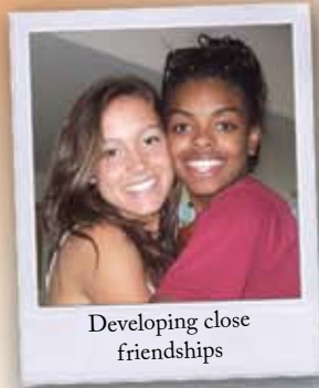
Developing close friendships