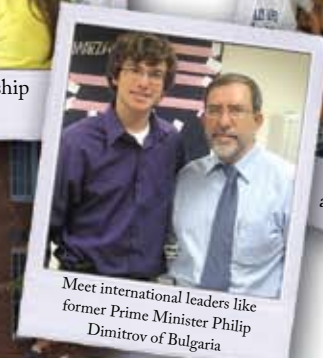
Meet international leaders like former Prime Minister Philip Dimitrov of Bulgaria