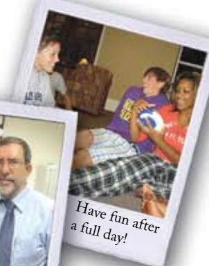
Have fun after a full day!