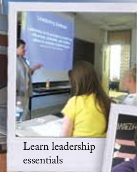
Learn leadership essentials